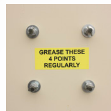
Central grease points